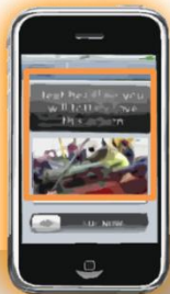
personalized mobile applications